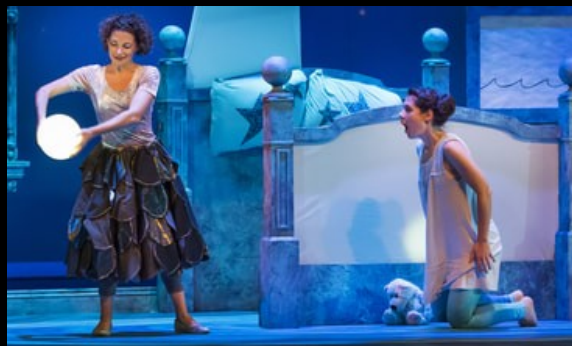
Wink Spellbound Theatre Page 5