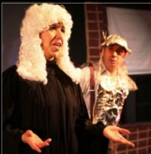
◀ Cinderella Tanglewood Marionettes Page 7