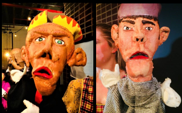
Don Quixote Takes New York